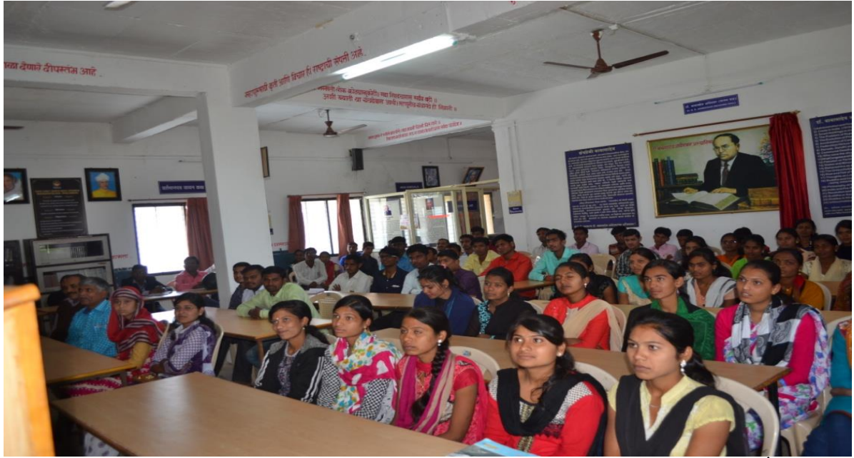
(Participated Students in one day Entrepreneurship Development Workshop)