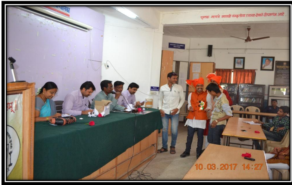
Fish-Pond: - Students of B.com. III year while enjoying the Fish-Pond.